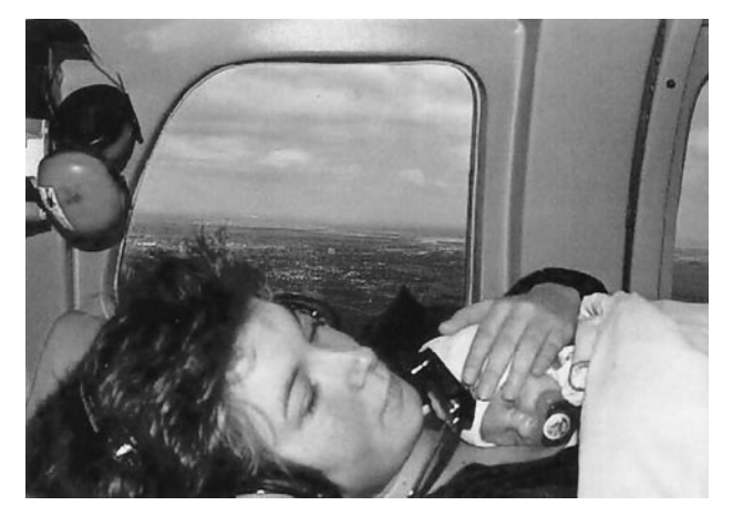
Fig 6. Mother with infant during kangaroo transport in a helicopter (back transfer after abdominal surgery).

transport seems to be safer than the usual incubator transport without safety devices for the infant.