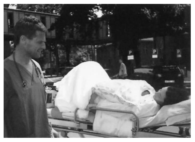
Fig 4. Mother with infant after kangaroo transport (40 minutes). An additional blanket is placed on top of the mother and infant. Shown is a transfer in 1 hour after birth because of tachydyspnea (35 weeks' gestational age, 2070 g).