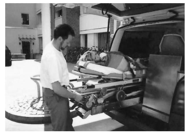
Fig 3. Mother with infant at arrival after kangaroo transport in an ambulance over a long distance (400 km, 5 hours).

during kangaroo transport as they are during routine kangaroo care.