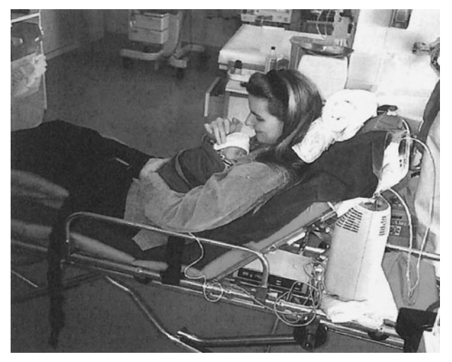
Fig 1. Mother with infant before kangaroo transport. The mother is fixed to a portable gurney by straps, with the upper part of her body at 60° semiupright. The infant is fixed to her with a broad infant-carrying sling, with liquid oxygen and the monitor positioned on the head end of gurney.

the infants have to be transported from the perinatal center to a continuous care unit in another children's hospital (back transfer). Although kangaroo care has been implemented in several countries with very promising outcomes,<sup>13–15</sup> kangaroo transport as an alternative to incubator transport has not been documented before.