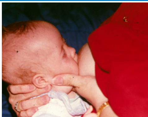
Figure 3. Dancer hand position supports the infant's jaw, decreasing the workload of maintaining a proper latch while helping prevent the infant from slipping off of the breast. Used with permission, B.Wilson-Clay, K. Hoover, The Breastfeeding Atlas , 3rd ed.

The best supplement is expressed colostrum/milk or banked human milk if available. Feeding volumes of 5 to 10 ml every 2 to 3 hours on the first day, with 10 to 20 ml on day 2, and 20 to 30 ml on day 3 are suggested (Stellwagen, Hubbard, & Wolf, 2007). Mothers can hand express colostrum into a spoon and spoon feed this to the infant (Figure 4) (Hoover, 1998). If a pump is used to express colostrum, the small amounts may cling to the sides of the collection container leaving little for actual use. Pumping into a small container such as an Ameda diaphragm that has been placed between the valve and the collection bottle of either an Ameda or Medela breast pump may yield a greater quantity of usable colostrum (Figure 5). After that, volumes will be dependant on metabolic requirements and feed-