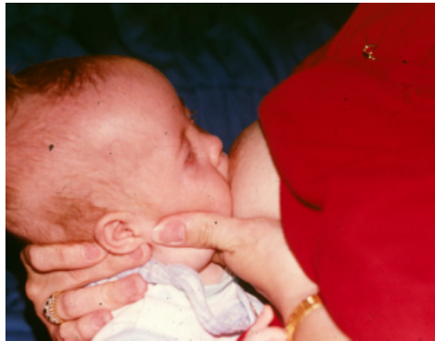
Figure 3. Dancer hand position supports the infant's jaw, decreasing the workload of maintaining a proper latch while helping prevent the infant from slipping off of the breast. Used with permission, B.Wilson-Clay, K. Hoover, The Breastfeeding Atlas , 3rd ed.

The best supplement is expressed colostrum/milk or banked human milk if available. Feeding volumes of 5 to 10 ml every 2 to 3 hours on the first day, with 10 to 20 ml on day 2, and 20 to 30 ml on day 3 are suggested (Stellwagen, Hubbard, & Wolf, 2007). Mothers can hand express colostrum into a spoon and spoon feed this to the infant (Figure 4) (Hoover, 1998). If a pump is used to express colostrum, the small amounts may cling to the sides of the collection container leaving little for actual use. Pumping into a small container such as an Ameda diaphragm that has been placed between the valve and the collection bottle of either an Ameda or Medela breast pump may yield a greater quantity of usable colostrum (Figure 5). After that, volumes will be dependant on metabolic requirements and feed-