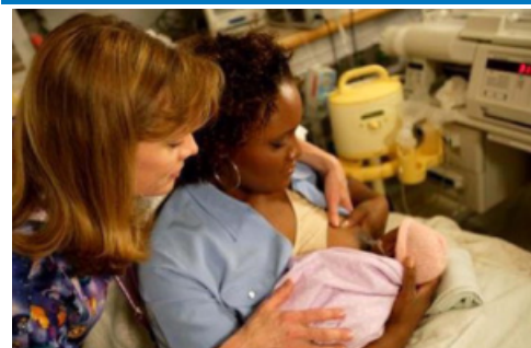
Figure 2. Cross cradle positioning allows the mother to support the infant's trunk and gives her complete control over flexion and extension of the head.

these, as infants may experience extreme flexion of the trunk and neck, impeding full rib cage expansion and contributing to collapse of the airway. Clutch (Figure 1) or cross cradle (Figure 2) are positions of choice (Meier, Furman, & Degenhardt, 2007). Mothers are instructed not to flex the head when using either of these positions. When utilizing the clutch positioning, care should be taken to assure that the breast does not rest on the baby's