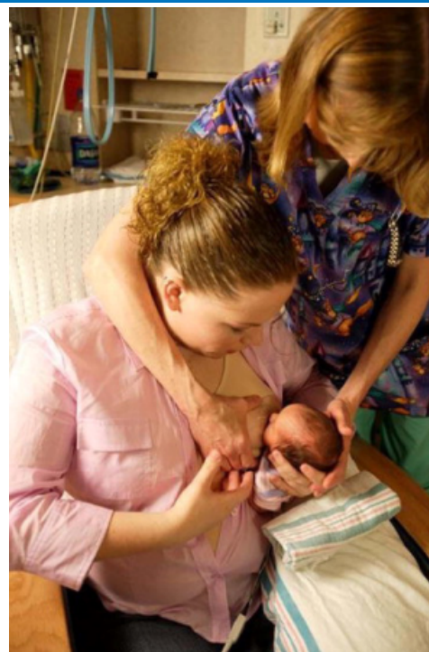
Figure 1. Clutch positioning. Mother's hand encircles the infant's head providing support but not flexing the head to the breast.

Careful feeding positioning is necessary to avoid apnea, bradycardia, or desaturation, especially for the younger infants with decreased muscle tone. They are more prone to positional apnea due to airway obstruction so that feeding positions that cause excessive flexion of the neck or trunk are best avoided. The traditional cradle hold is one of