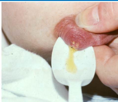
Figure 4. Hand expressing colostrum into a spoon as a supplement for spoon feeding to the infant. Used with permission, B.Wilson-Clay, K. Hoover, The Breastfeeding Atlas , 3rd ed.

The best supplement is expressed colostrum/milk or banked human milk if available. Feeding volumes of 5 to 10 ml every 2 to 3 hours on the first day, with 10 to 20 ml on day 2, and 20 to 30 ml on day 3 are suggested (Stellwagen, Hubbard, & Wolf, 2007). Mothers can hand express colostrum into a spoon and spoon feed this to the infant (Figure 4) (Hoover, 1998). If a pump is used to express colostrum, the small amounts may cling to the sides of the collection container leaving little for actual use. Pumping into a small container such as an Ameda diaphragm that has been placed between the valve and the collection bottle of either an Ameda or Medela breast pump may yield a greater quantity of usable colostrum (Figure 5). After that, volumes will be dependant on metabolic requirements and feed-