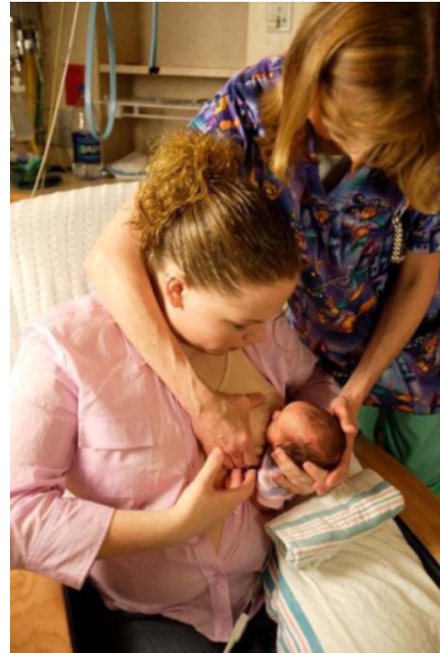
Figure 1. Clutch positioning. Mother's hand encircles the infant's head providing support but not flexing the head to the breast.

Careful feeding positioning is necessary to avoid apnea, bradycardia, or desaturation, especially for the younger infants with decreased muscle tone. They are more prone to positional apnea due to airway obstruction so that feeding positions that cause excessive flexion of the neck or trunk are best avoided. The traditional cradle hold is one of